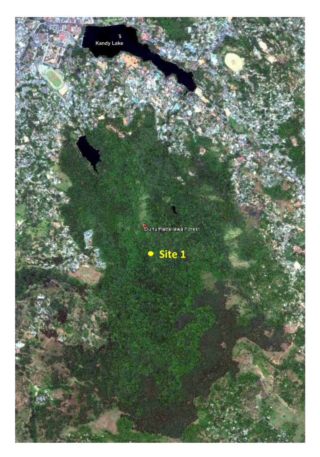
Figure 1 Site 1: Satellite image of the Dunumadalawa Forest Reserve, Kandy (7°17'00"North, 80°38'49"East; 548-960 m above sea level).

observations were not carried out during extreme weather conditions such as heavy rain (Bibby et al. , 2000). As a control experiment, the same sampling protocol was used and same sampling effort was done in nearby home gardens and results were compared with those of the forest reserve.