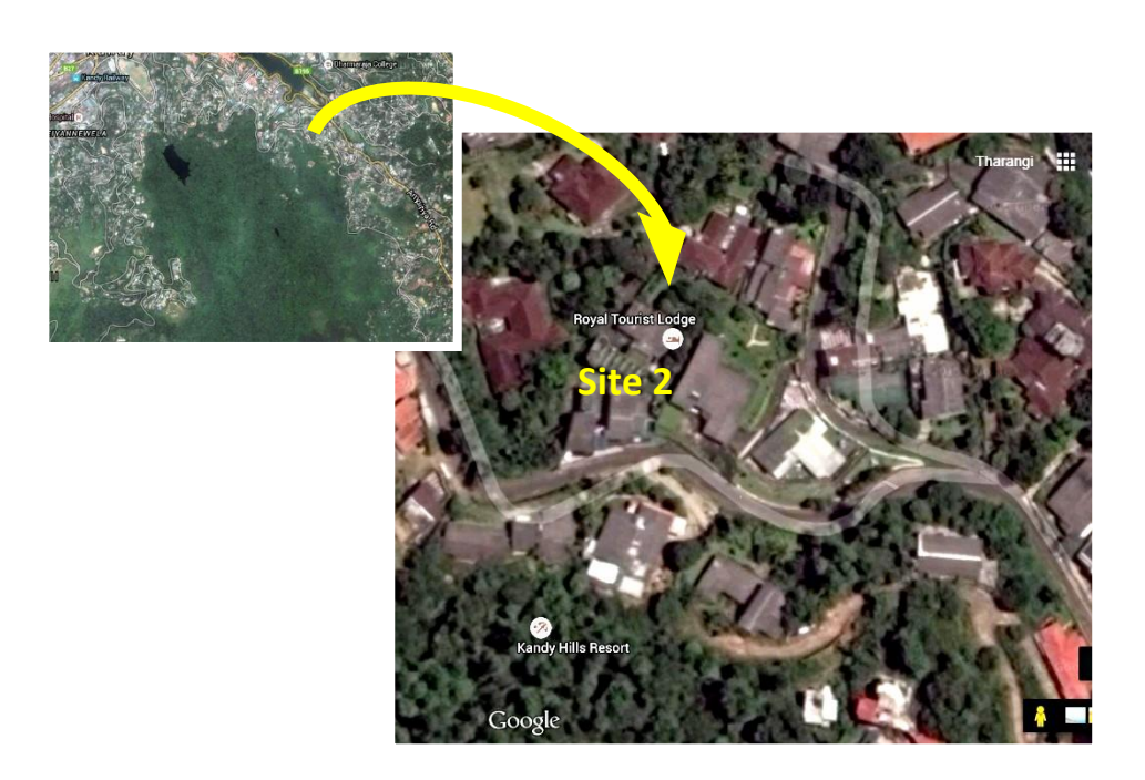
Figure 2: Site 2: Home gardens adjacent (within 50 m) to the north-eastwards side of the margin of Dunumadalawa Forest Reserve (7° 17' 47" North, 80° 38' 6" East) (Along the Rajapihilla Mawatha).