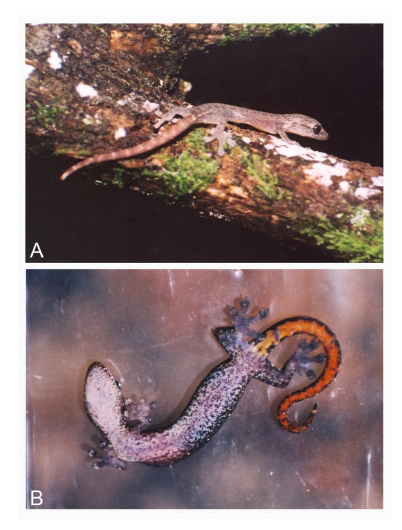
Figure 2: A, B: Juveniles of Hemiphyllodactylus typus from Morankanda Mukalana (loc. 18). The black caecum characteristic mainly for unisexual species is visible (2B).